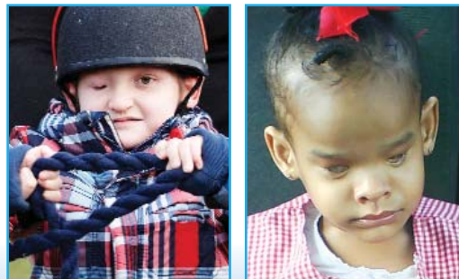
Unilateral Anophthalmia and Bi-lateral Anophthalmia

The occurrence of Anophthalmia and Microphthalmia has been related to some illnesses during pregnancy including virus infections, such as rubella ( German Measles ) and Varicella ( Chicken Pox ). It has also been linked to some drugs taken during pregnancy, including recreational drugs and thalidomide. There has been a suggestion that insecticides and fungicides used to spray crops may be related to eye and other congenital anomalies, but to date there is no scientific proof to support this, only indirect evidence from animal studies. Also over the last few years a growing number of genes have been identified that are important in Anophthalmia or the related conditions Microphthalmia and Coloboma.